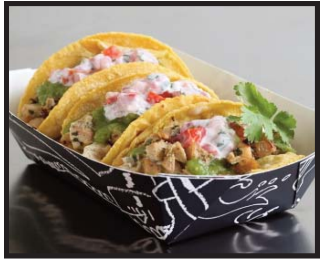
CILANTRO CHICKEN TACO