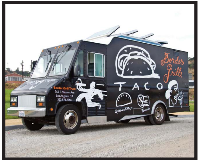
BORDER GRILL TRUCK