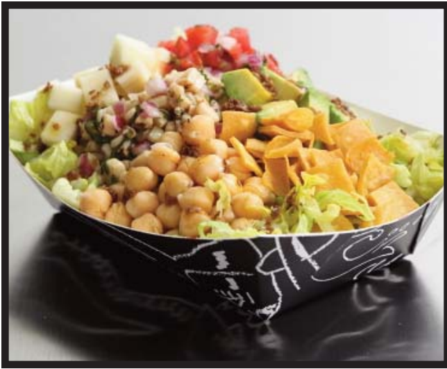
MEXICAN CHOPPED SALAD