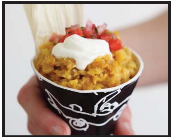
GREEN CORN TAMAL