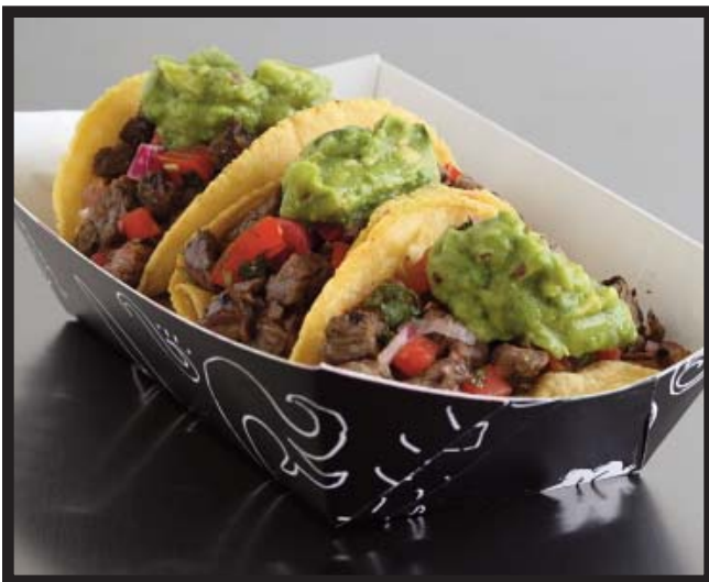
CARNE ASADA TACO