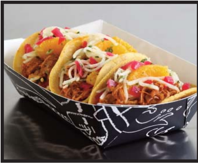
YUCATAN PORK TACO