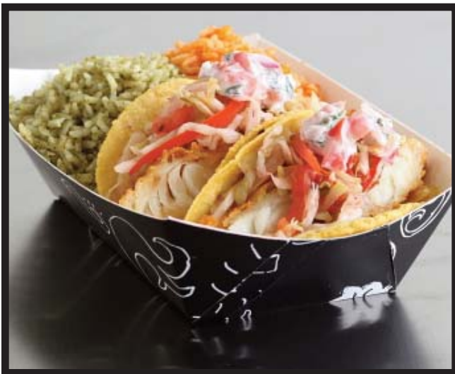
CRISPY BAJA FISH TACO