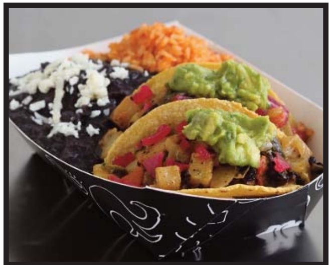
POTATO RAJAS TACO