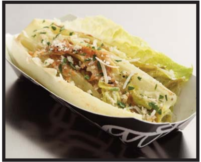
GRIDDLED CAESAR SALAD