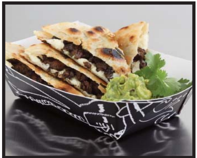
CARNE ASADA QUESADILLA